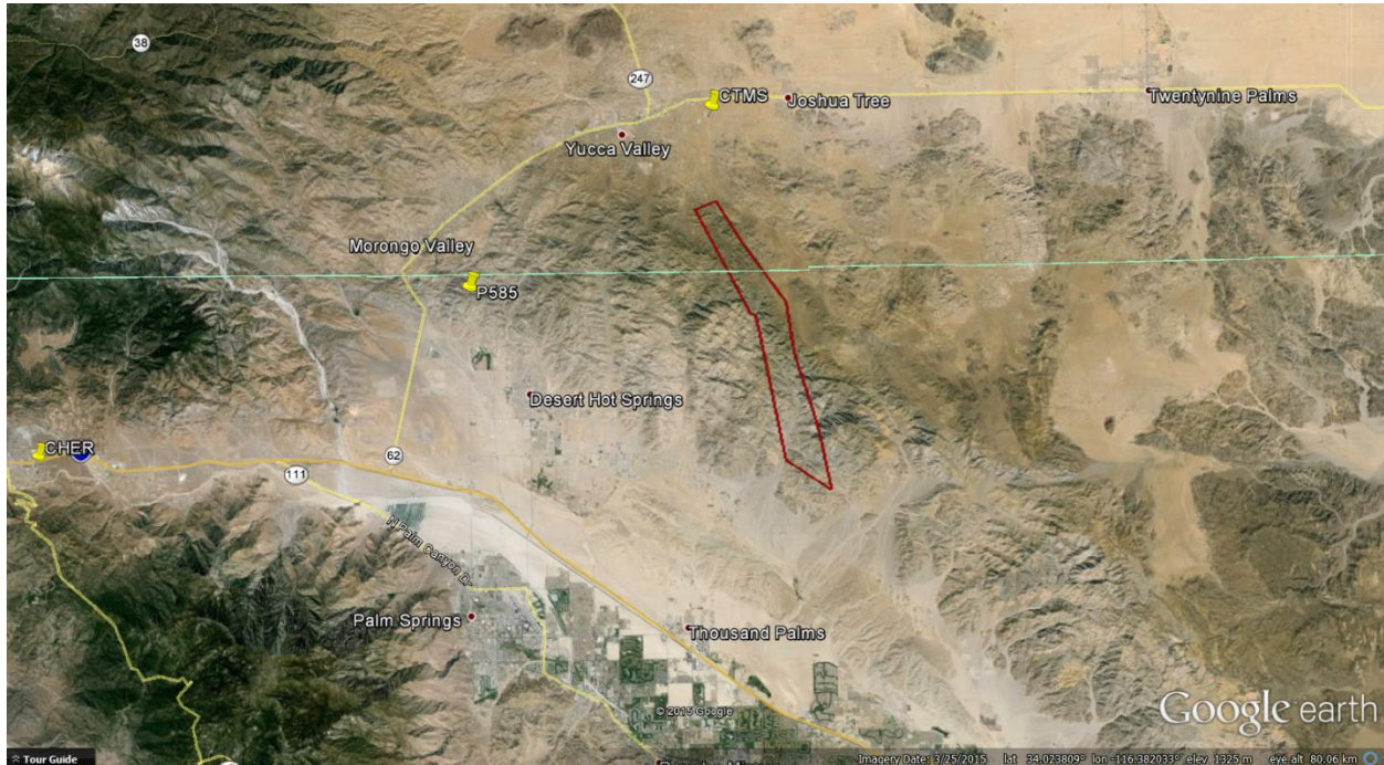
Figure 1 – Location of survey polygon (in red). Yellow push pins represent the locations of GPS reference stations. (Google Earth).

The requested survey area consisted of a polygon located 25 km northeast of Palm Springs, CA. The polygon encloses approximately 50 square km. Figure 1 (below) is an image from Google Earth showing the location of the survey.