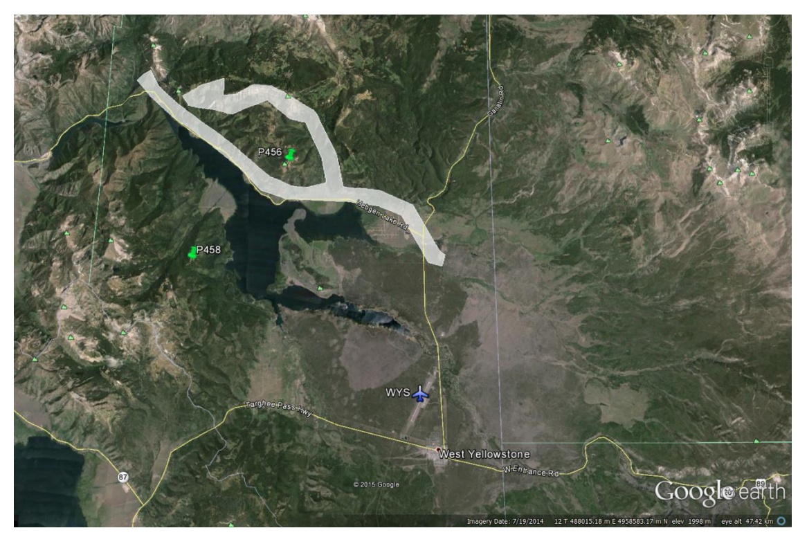
Figure 1 – Shape and location of survey polygon. P456, P458, and WYS indicate locations of GPS reference stations.

The requested survey area consisted of a corridor polygon located 20 km NW of West Yellowstone, MT. The polygon measures about 1 km wide and encloses approximately 40 square km. Figure 1 (below) is an image from Google Earth showing the shape and location of the survey.