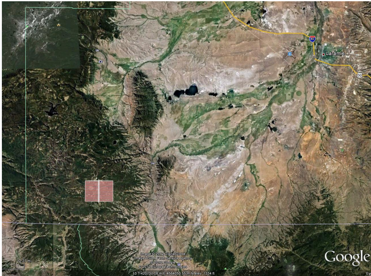
Figure 1 – Shape and location of survey area.

The survey area located 54 km Southwest of Laramie in Wyoming. The Area of Interest (AOI) is 25.04 km 2 and is shown in Figure 1.