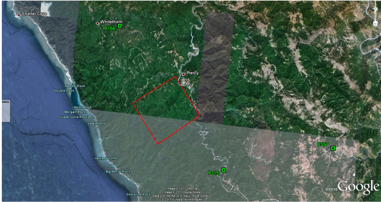
Figure 1 – Shape and location of survey polygon (Google Earth).

The survey area consisted of a square polygon located 25 km Southeast of Shelter cove, California, in California. The survey location is shown below in Figure 1.