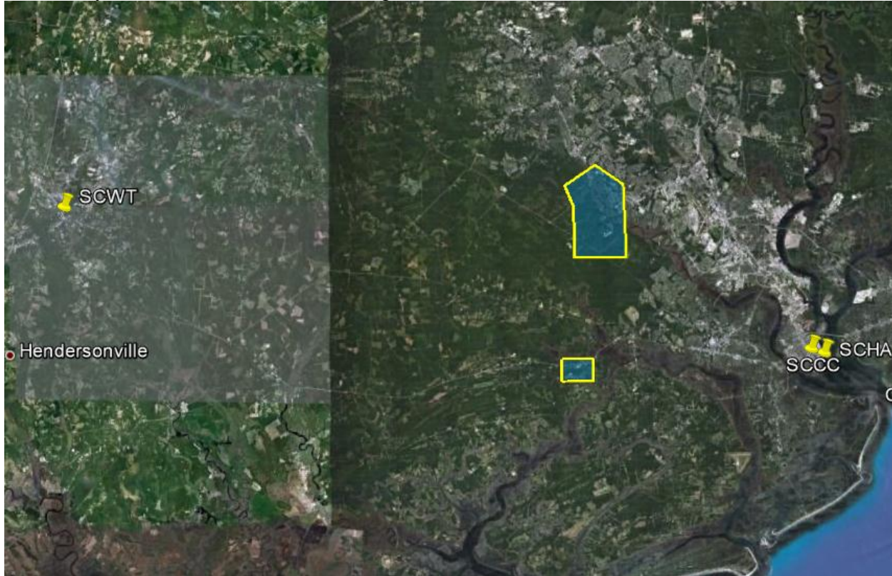
Figure 1 – Shape and location of survey polygon (Google Earth).

The survey area consisted of two polygons located 20 km West of Charleston, South Carolina. The survey location is shown below in Figure 1.