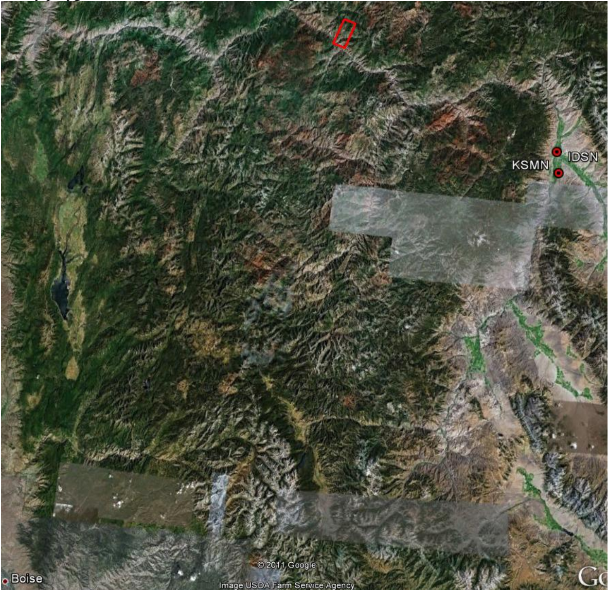
Figure 1 – Shape and location of survey polygon (Google Earth).

The survey area consisted of a polygon located 145 miles Northeast of Boise in Idaho. The survey polygon is shown with red outline in figure1.